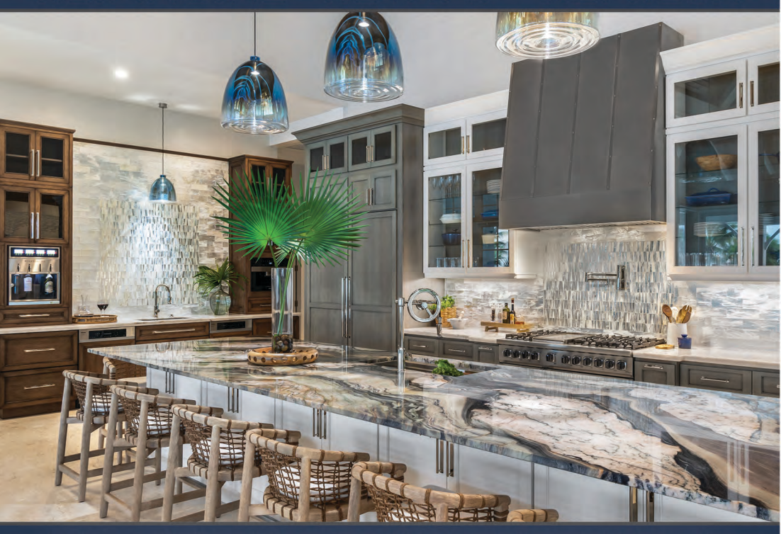
Locally owned and family-operated for over 60 years, D'Asign Source has the expertise to bring your vision to life—from design and construction to finishing touches, indoors and out.